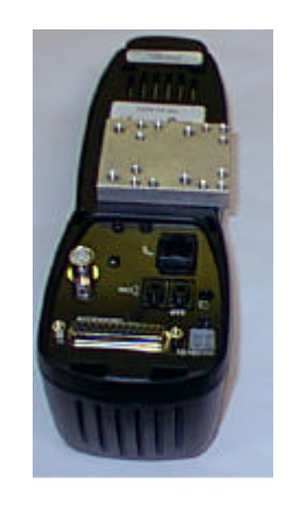
TOPA-VK-010 connects to TOPA-VK-002