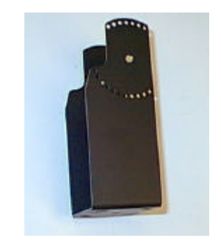
TOPA-VK-040 Triple height U bracket (180mm)