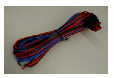
* Power cord is included in TOPA-VK-002 as well as key lock